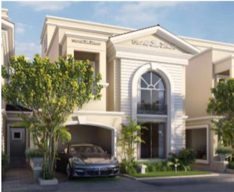
East Facing Villa 30 X 50