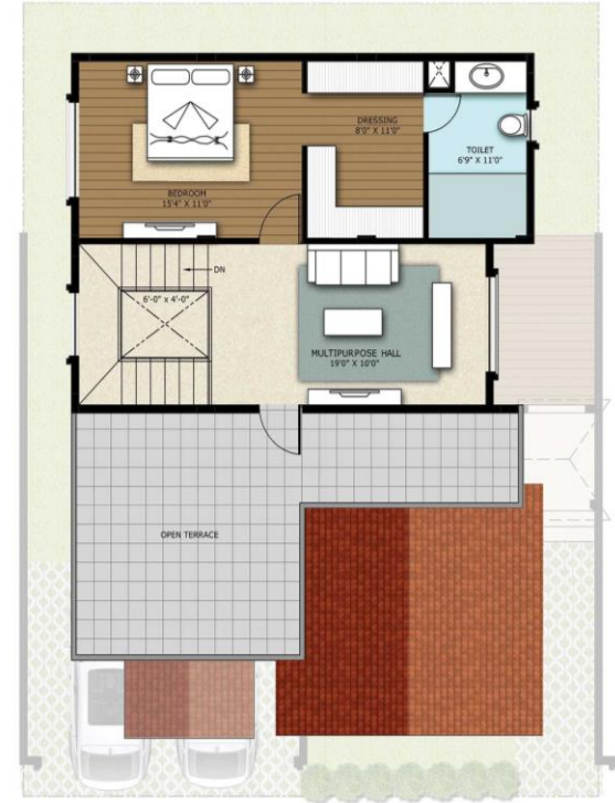
VICENZA EAST | 12M X 15M | 4BHK | AREA 3275 SFT | ► N