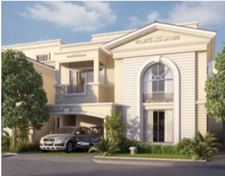
East Facing Villa 40 X 50