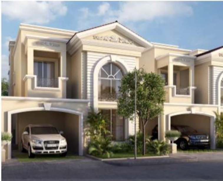
East Facing Villa 30 X 60