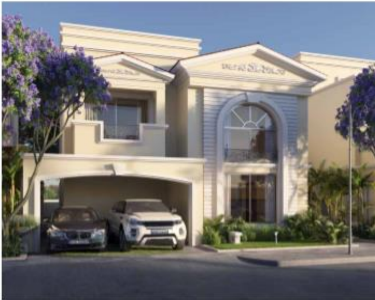
East Facing Villa 40 X 60